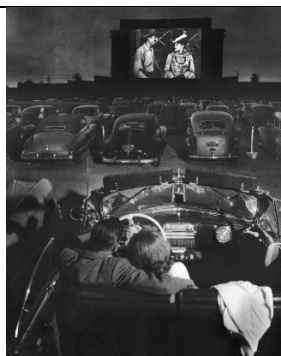
Drive-in theater, Los Angeles, 1949.