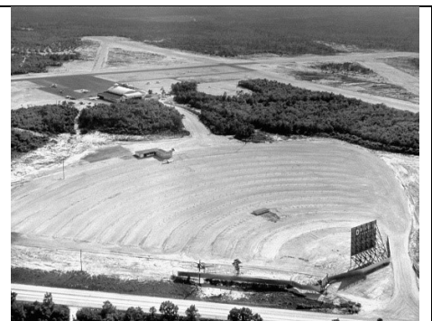
Aerial view of a "fly-in drive-in theater," with plane in parking lot, 1949.

Although most Drive-in movie theaters were operated in the summer months, we felt like this would be a splendid opportunity to share a little bit of the World's Greatest Hobby of Model Railroading with you. Come out and visit us during the Southern Christmas Show at The Park Expo & Conference Center, 800 Briar Creek Rd, Charlotte, NC 280205