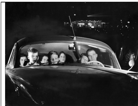
Drive-in theater, Chicago, 1951. Francis Miller—Time & Life Pictures/Getty Images. 10/27/2024 Time.com, article by Ben Cosgrove, 6/5/2023.

Among its advantages was the fact that older adults with children could take care of their infants while watching a movie. At the same time, youth found drive-ins ideal for dates. Unlike indoor cinema theaters, there was an air of informality that was appealing to people of all ages, but specifically to families.